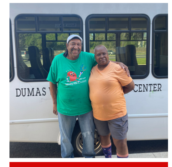
8,398 unique door-to-door transportation services provided for underserved youth and low-income seniors