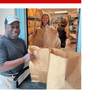
3,453 supplemental food boxes distributed to the community by The Joseph Project Food Pantry