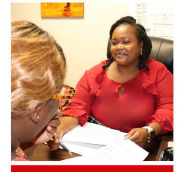
3,553 individualized case management sessions and 155 life skills classes provided for 240 homeless women and children