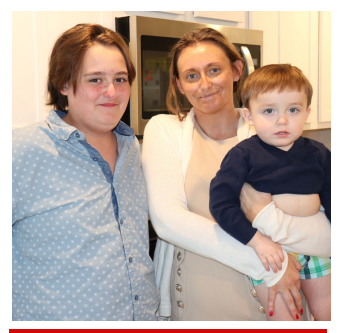
96% success rate among residents who completed the programs in 2024 and moved into permanent housing, according to HUD's national standards