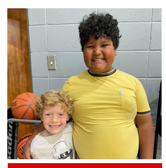
4,615 meals served to 83 school-age children and 709 hours of activities offered to participants in the After School and Summer Programs